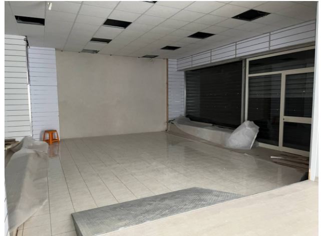
PIANO PRIMO SOTTOSTRADA H=3.32 mt

Via Teocrito, 54 Via Luigi Rizzo, 41 Catania