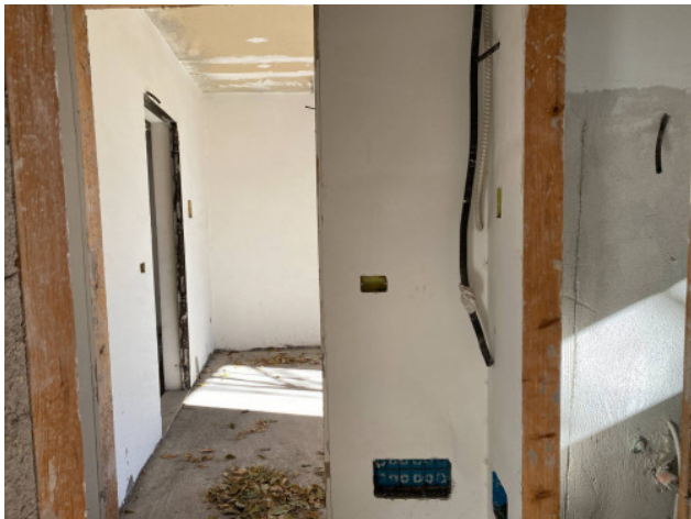
Via Buda, Via Pistone - Catania