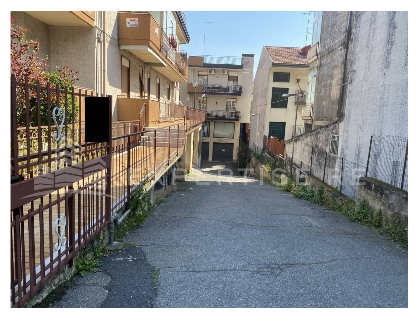
600 sq.m. | Bathrooms: 2 | Rooms: 1

COMMERCIAL PREMISES WITH WAREHOUSE TO LEASE IN VIAGRANDE 8 windows, internal surface area 600 m2, external area 500 m2