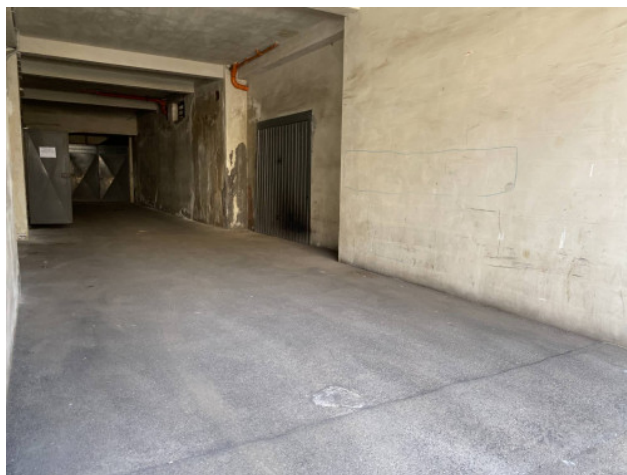
Appartamento via Salvo D'Acquisto 24, Aci Catena (CT)